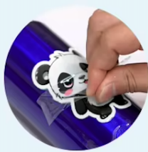
Tear off the Film B