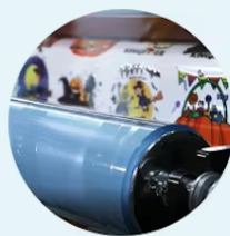
Cover with Film B