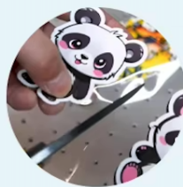
Cut the pattern