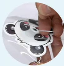
Tear off th Film A