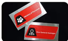
Stainless steel sheet