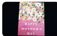
PVC expansion sheet